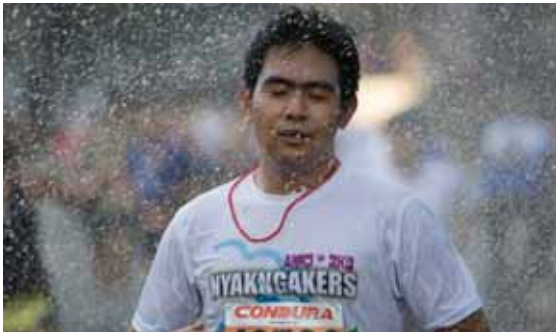
A runner cools himself under the water shower