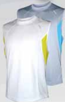
equipe MMS SLATE