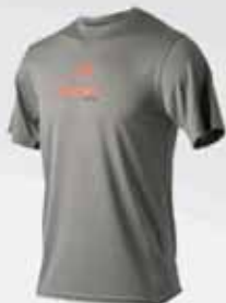
NEWTON BOSTON TRAINING TEE