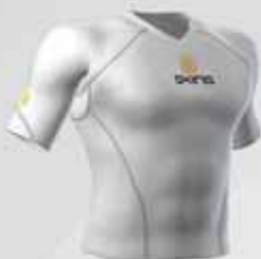
SKINS. COMPRESSION WEAR