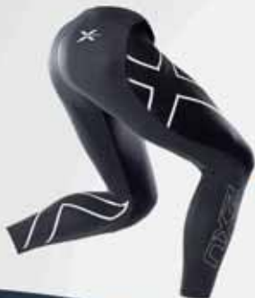
ZXU ELITE COMPRESSION TIGHTS