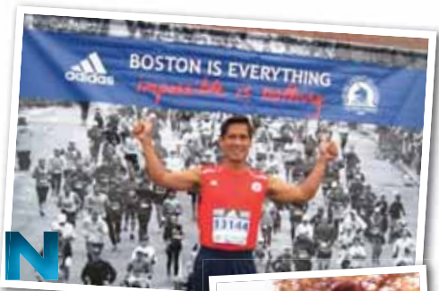
Boston Marathon Start at Hopkinton

My only goal after the first marathon was to run the LA marathon every year. I did