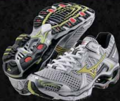
WAVE CREATION 11 Official shoe

Purchase WAVE CREATION 11 and get a RACE PACK for FREE!