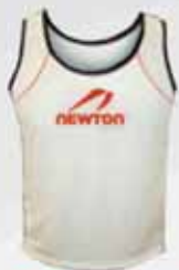
NEWTON DESCENTE TANK TOP