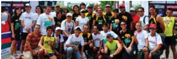
All-smiling at the successful running of the marathon they organized, the Cebu Executive Runners Club (CERC) members pose at the finish line

CEBU MARATHON 2010 The Cebu City Marathon represented what Cebu and the Sinulog were all about. Historical. Upbeat. Passionate. Festive. It was a showcase of the warmth and pride of the Cebuanos.