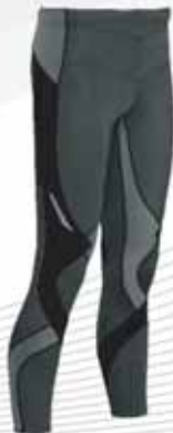
CWX. STABILYX TIGHTS